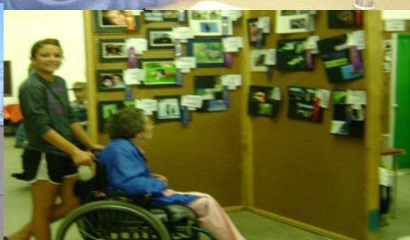
On Friday July 30th the residents went to the Fair. They enjoyed pie at the end of their trip.